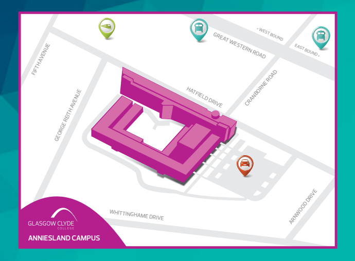
Anniesland Campus, 19 Hatfield Drive, Glasgow G12 OYE